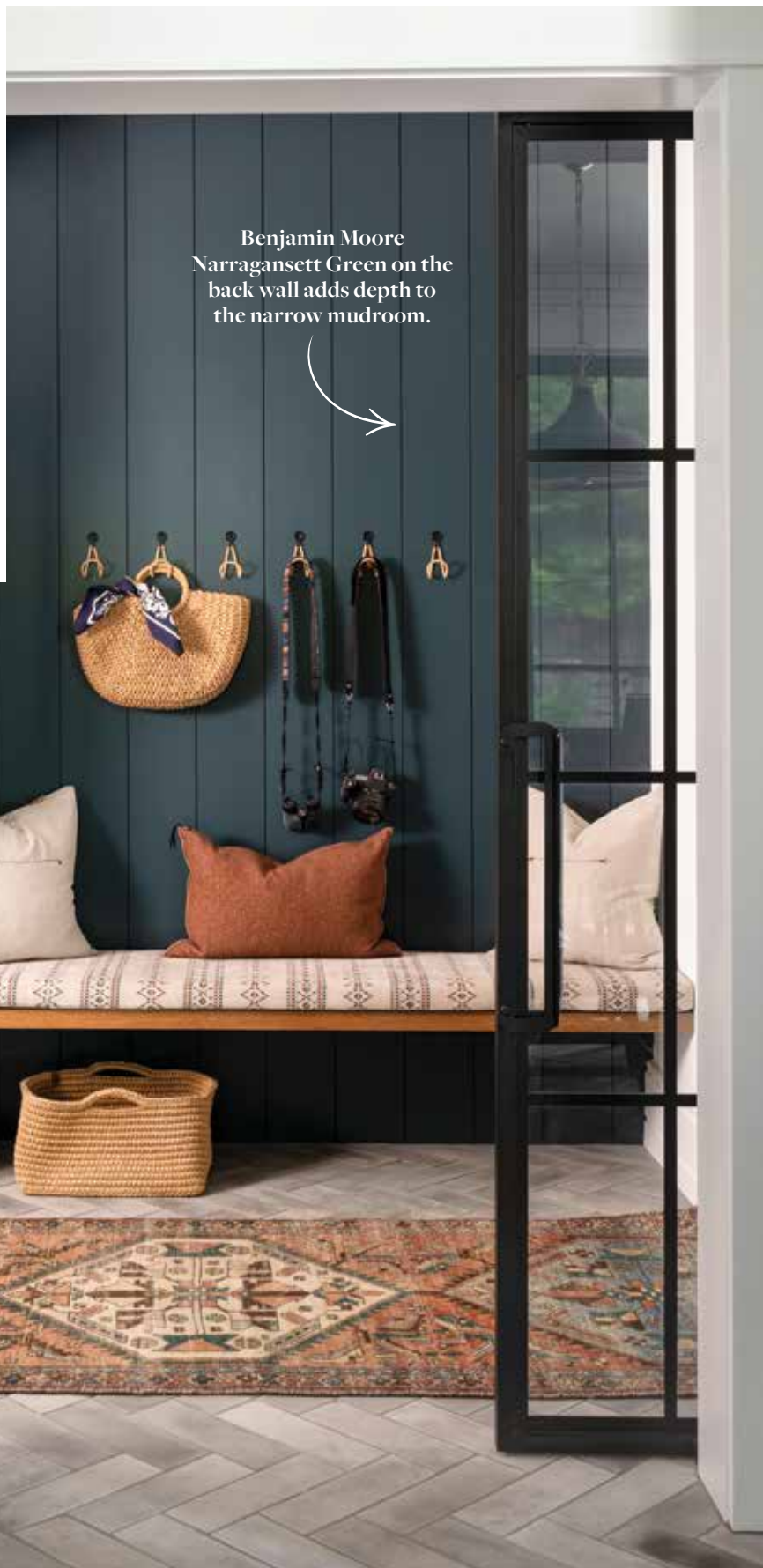
Benjamin Moore Narragansett Green on the back wall adds depth to the narrow mudroom.